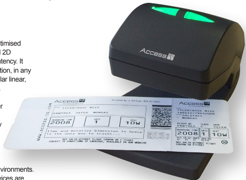
LSR120 compact omnidirectional 2D barcode reader

The serial and USB versions of the LSR120 may be configured with data format settings as standalone devices, and the USB versions may additionally be configured to work with the power parsing language built into the Access 'Comserv' driver.