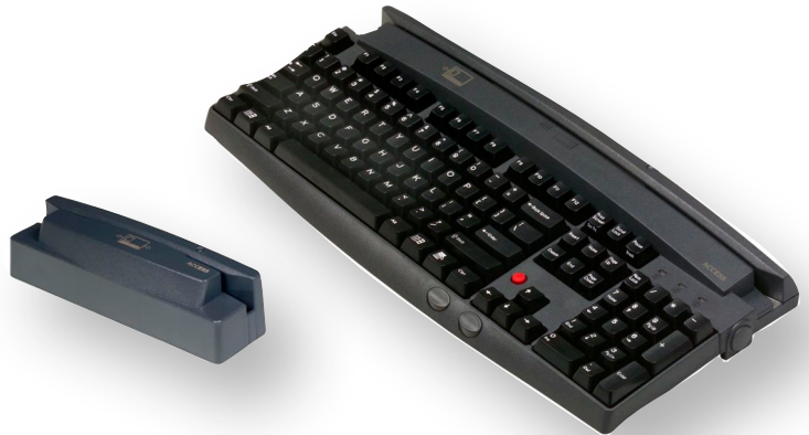
LSR120 connects to ATB2 keyboards and desktop readers